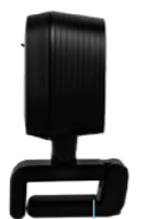
Tripod screw hole